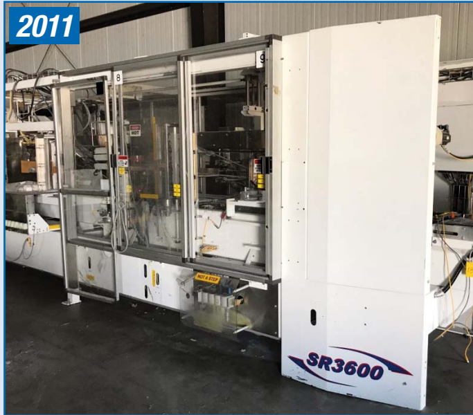
EDSON SR3600 CASE PACKER