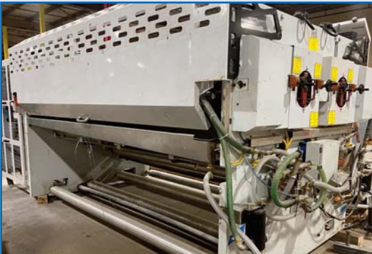
FIBREFLOW FF350 DRUM REPULPING SYSTEM